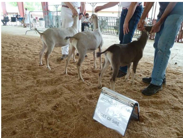
Jr. Produce of Dam: Thistle Corner